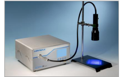
Rod Lenses Shown: BlueWave 200 with 8 mm rod lens (rod lenses require an 8 mm lightguide) 5 x 2" Area (~100 mW/cm 2 ) PN 38699 5" x 5" Area (~30 mW/cm 2 ) PN 38698