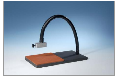
Lightguide Mounting Stand (fits 3 mm, 5 mm and 8 mm lightguides) PN 39700

Gray Tinted PN 35285 Green Tinted PN 9162044