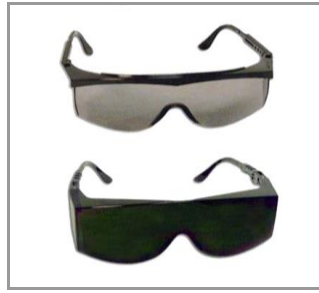
UV-Blocking, Over-the-Glasses Eye Protection

Gray Tinted PN 35285 Green Tinted PN 9162044