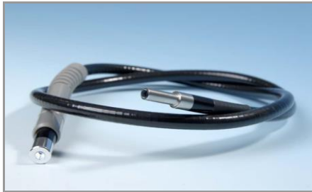
Liquid Lightguides available in 1-, 2-, 3-, & 4-pole configurations (see Table 1 on Page 3 for sizes and part numbers)