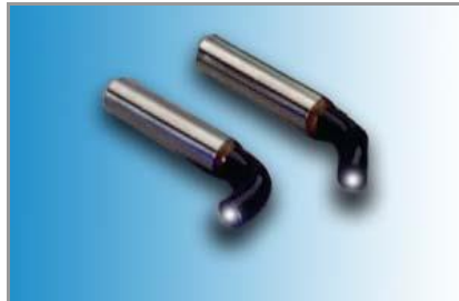
Angled Terminators for Lightguides 3 mm/60° PN 39029 ■ 3 mm/90° PN 39030 5 mm/60° PN 38042 ■ 5 mm/90° PN 38049