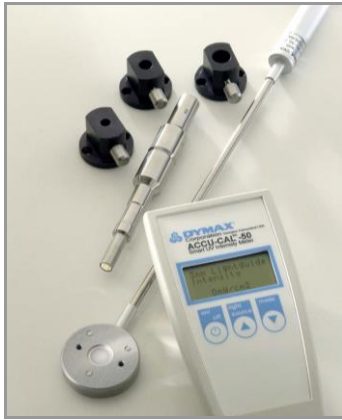
ACCU-CAL™ 50 Radiometer for measuring the UV intensity of spot lamps, flood lamps, and conveyor systems PN 39560