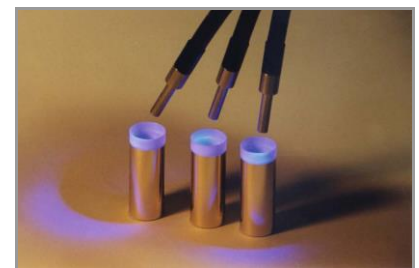
Trifurcated wand curing metal-to-plastic assembly

1 As measured with a Dymax ACCU-CAL™ 50 Radiometer (320-395 nm) and Lightguide simulator. Excessive on/off cycles and improper cooling may affect bulb degradation and therefore no warranty is expressed or implied.